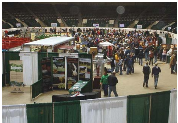
Visitors take in the commercial exhibits at the Expo.