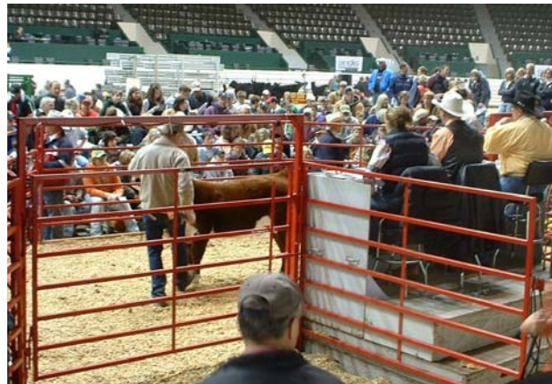
Delaney Herefords, Lake Benton had the high selling Hereford heifer. Lind Herefords had the high selling Hereford steer calf.